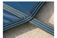
Safety Cover With Center Step