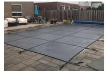
Safety Cover With Center Step